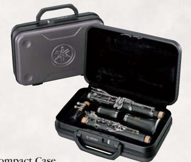
Compact Case This attractive and stylish case is made to stack for easy storage, and offers extremely durable protection for the YCL-450 and 250.

The YCL-250 incorporates all the lessons we've learned from crafting our high-end models. Made of ABS resin, it is exceptionally durable, maintenance-free, and resistant to moisture. And it features the revolutionary new 'V Pads'. These synthetic pads are extremely resistant to damage from moisture or oil, are easier to care for than traditional pads, and provide long-lasting adjustments.