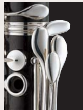
The YCL-650 and 450 models are available with an E b lever.

The 650 is an excellent alternative for those who are serious about their clarinet performance but need to watch their budget. The specifications of its bell, barrel, toneholes and other features are very close to those of the Custom SEV model, so its sound is warm, round, and deeply resonant. Made of carefully select and seasoned Grenadilla wood and boasting an enormous amount of handcrafting and hand finishing, the 650 features tapered toneholes which are undercut by hand for precise intonation and superior tonal balance. It also features beautifully sculpted keys whose touch has been regulated by master artisans for perfect balance.