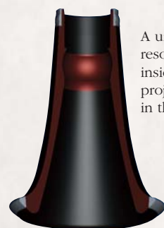
A unique scalloped resonance chamber inside the bell improves projection and intonation in the lower register.