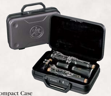
Compact Case This attractive and stylish case is made to stack for easy storage, and offers extremely durable protection for the YCL-450 and 250.

The YCL-250 incorporates all the lessons we've learned from crafting our high-end models. Made of ABS resin, it is exceptionally durable, maintenance-free, and resistant to moisture. And it features the revolutionary new 'V Pads'. These synthetic pads are extremely resistant to damage from moisture or oil, are easier to care for than traditional pads, and provide long-lasting adjustments.