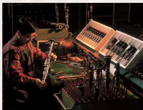
Craftsman makes final inspection of a Yamaha clarinet. All Yamaha clarinets are made by gifted artisans whose fine touch has been developed over long years of apprenticeship to a master.

Yamaha's V Series Custom clarinets represent a pinnacle in the art of clarinet making. Some of the finest instruments ever produced, they are made with a perfect blend of timeless, traditional craftsmanship and cutting edge technology. Precisely balanced and light to the touch, they permit you to effortlessly create the tonal colors you desire—to forget about the technical aspects of your performance and concentrate on pure musicality. And their highly expressive, resonant tone will make you sound good in any concert hall. They are available in two styles, offering finely calibrated differences (bore size, undercuts, etc.) to meet your individual needs.