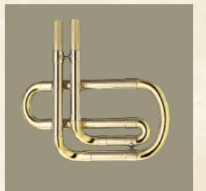
F natural slide

Single horn in B b Solid valve rotors Bell throat: medium (M) Bore: 12mm (0.472") Yellow brass A/plus stop valve Epoxy lacquer finish Mouthpiece 32C4