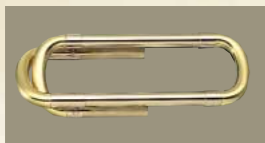
E b tuning slide

Single horn in F Solid valve rotors Bell throat: medium (M) Bore: 12mm (0.472") Yellow brass Epoxy lacquer finish Mouthpiece 32C4