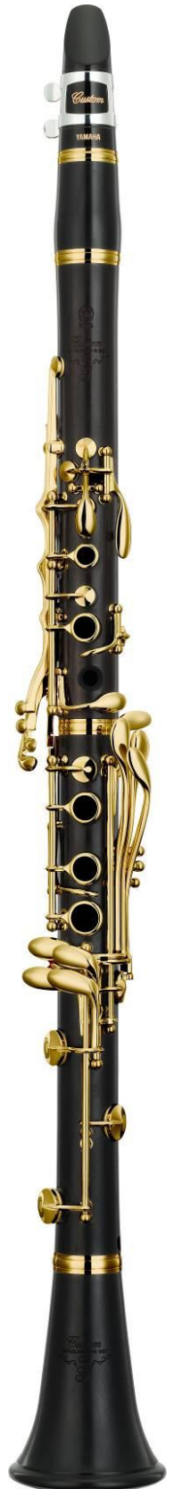
YCL-CSG A III H