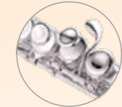
Assisted Fingering Key