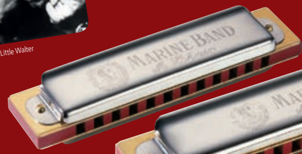
» Marine Bands with extended range. «