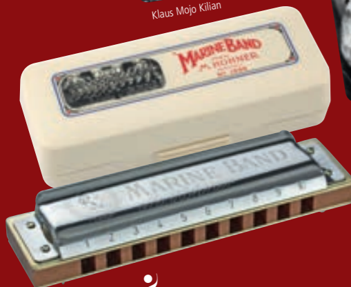
» Since 1896, the harmonica of Legends! «