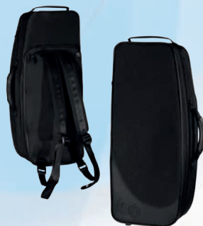
A case specially designed for the Axos saxophone, with backpack straps.

Henri SELMER Paris ambassadors recommend Axos