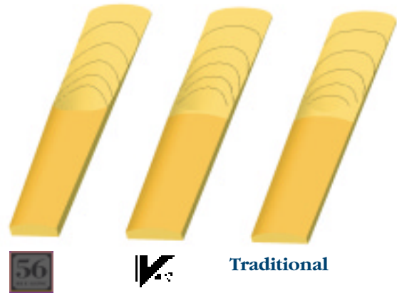
A topographical diagram of each cut, with the lines connecting areas of equal thickness. The more pointed the arch, the thicker the spine and heart, and conversely, the thinner the side bevels.