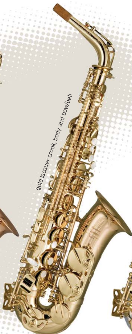
gold lacquer crook, body and bow/bell