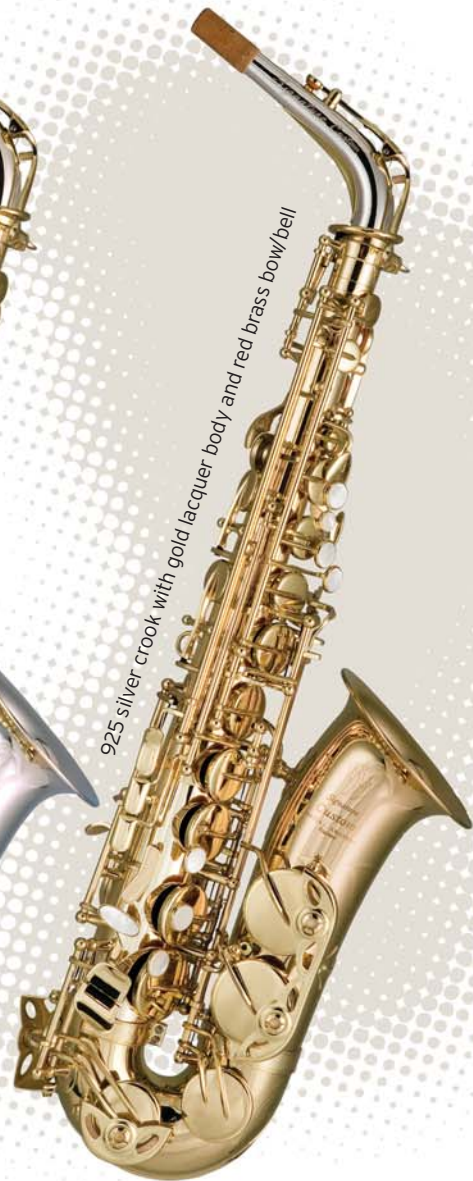
925 silver crook with gold lacquer body and red brass bow/bell