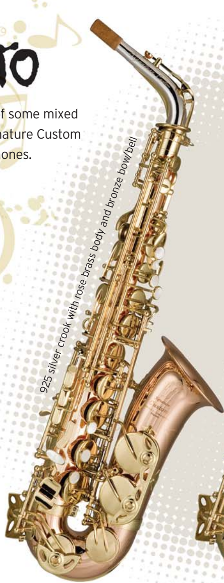
925 silver crook with rose brass body and bronze bow/bell

Examples of some mixed metals Signature Custom alto saxophones.