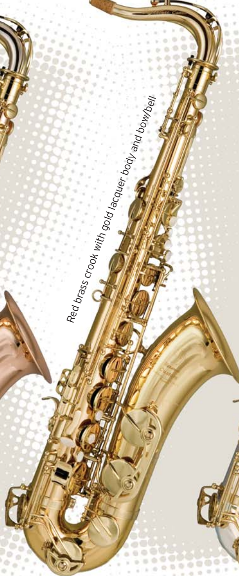
Red brass crook with gold lacquer body and bow/bell