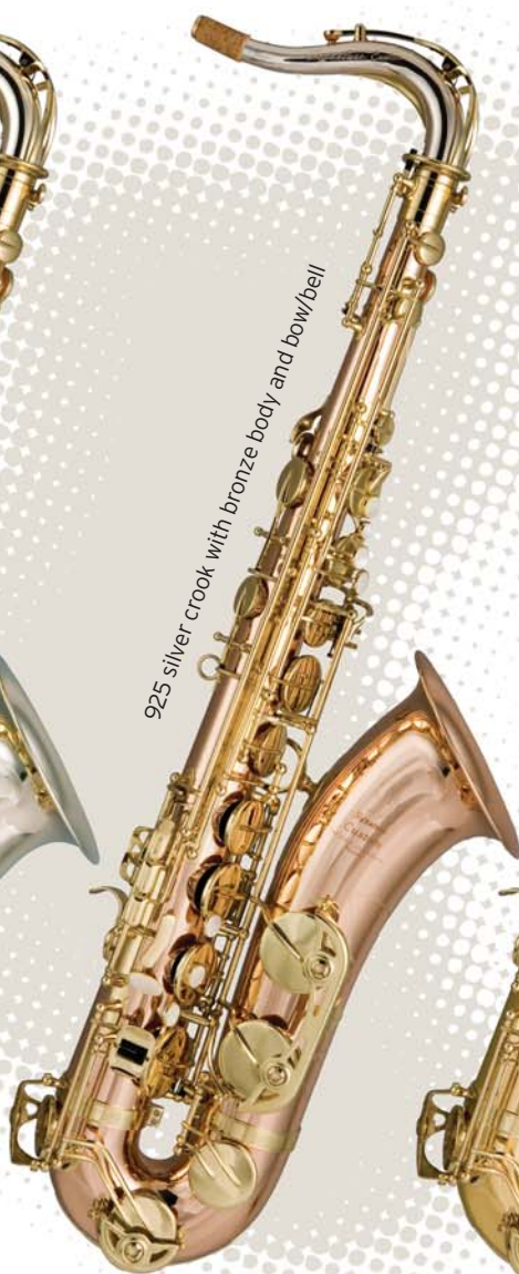
925 silver crook with bronze body and bow/bell