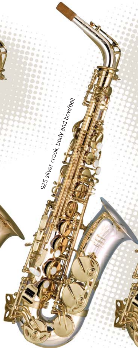
925 silver crook, body and bow/bell