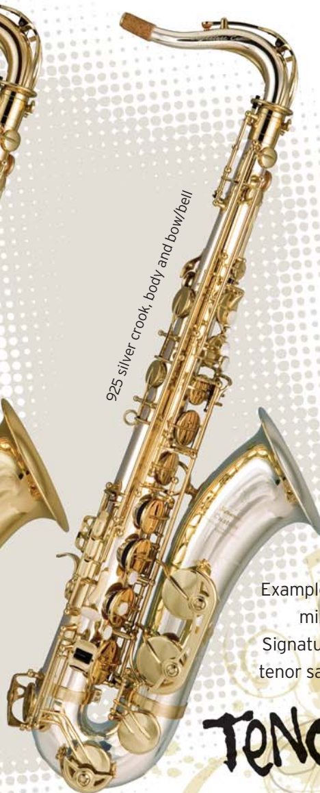
925 silver crook, body and bow/bell

Examples of some mixed metals Signature Custom tenor saxophones.