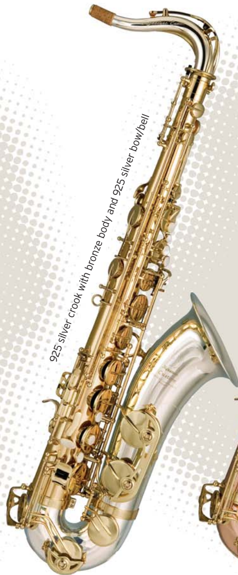
925 silver crook with bronze body and 925 silver bow/bell